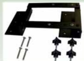
QD800PMP2 PR 400/500/570/800 MS (Required)