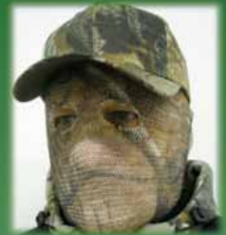
SF301AP Realtree AP