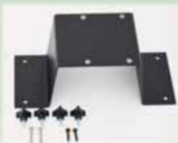
QD800PMP3 PR 900 (Required)