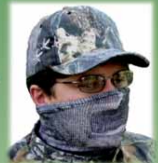
SF315MO Mossy Oak