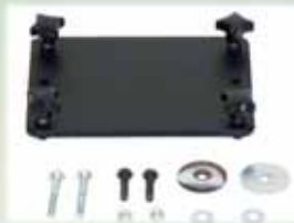
QD800-QDP Quick-Release plate (Optional)